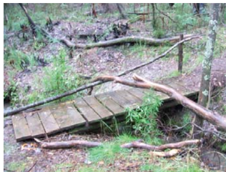
Examples of the infrastructure that requires upgrading to cater for the increasing visitor number to the site

Visitors to the site at the moment will note that the track from the picnic area to the Kelly Tree is closed. The bridge across Stringybark Creek from the picnic area to the camping ground has also been closed. Please observe these detours as the closures are for visitor safety reasons. These issues will be addressed by the site improvement works identified in the concept plan.